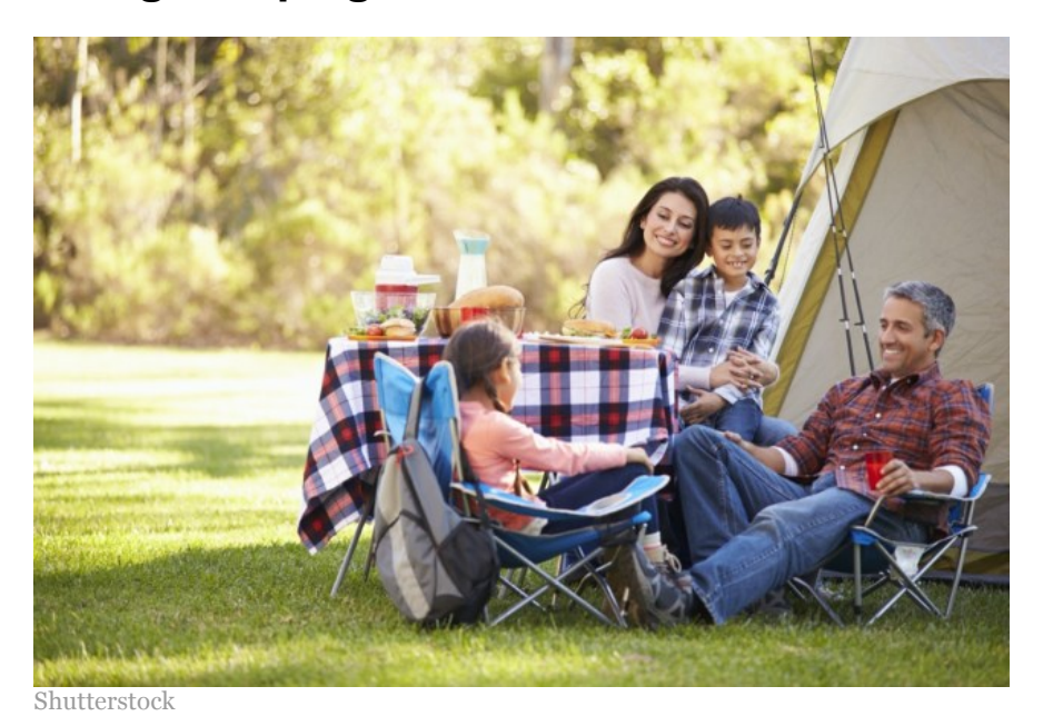
Risk Level: 2