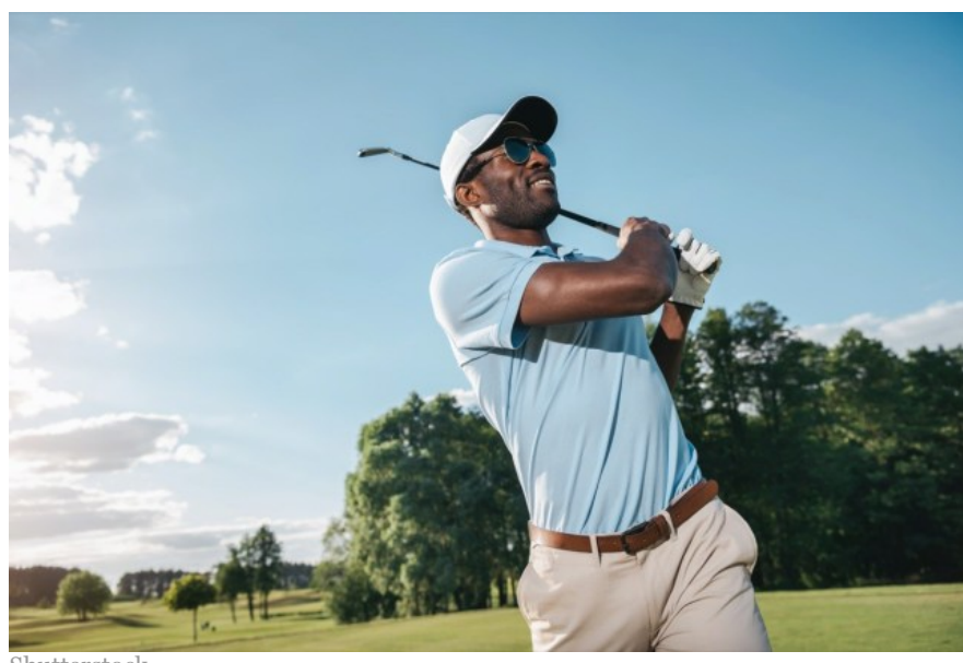
Risk Level: 3