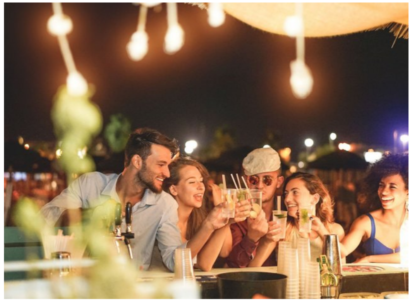
Risk Level: 9