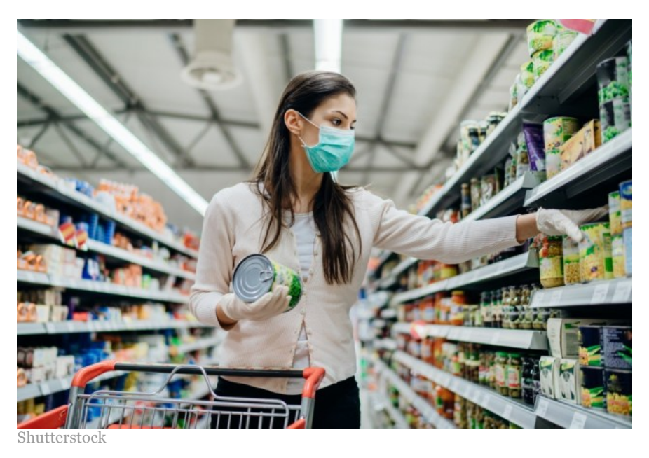
Risk Level: 3