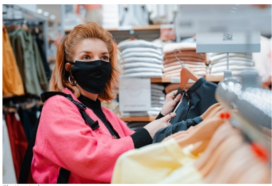
Risk Level: 5