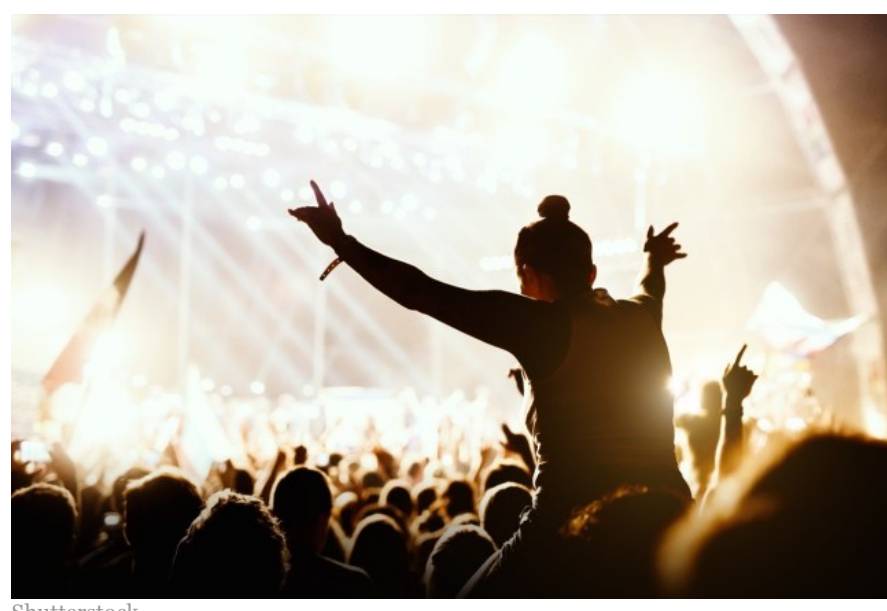
Risk Level: 9