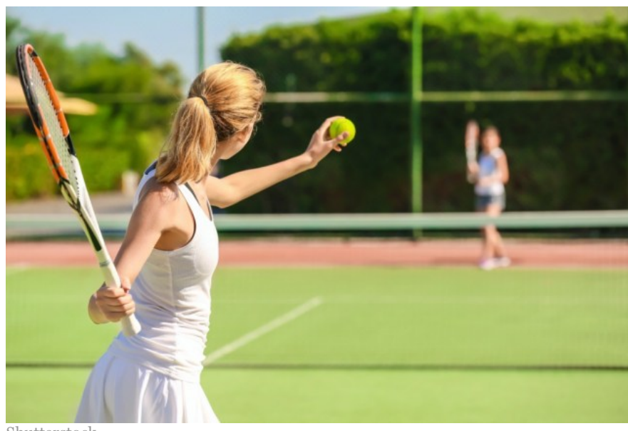
Risk Level: 2